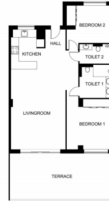
the bottom picture is indicative - not to scale